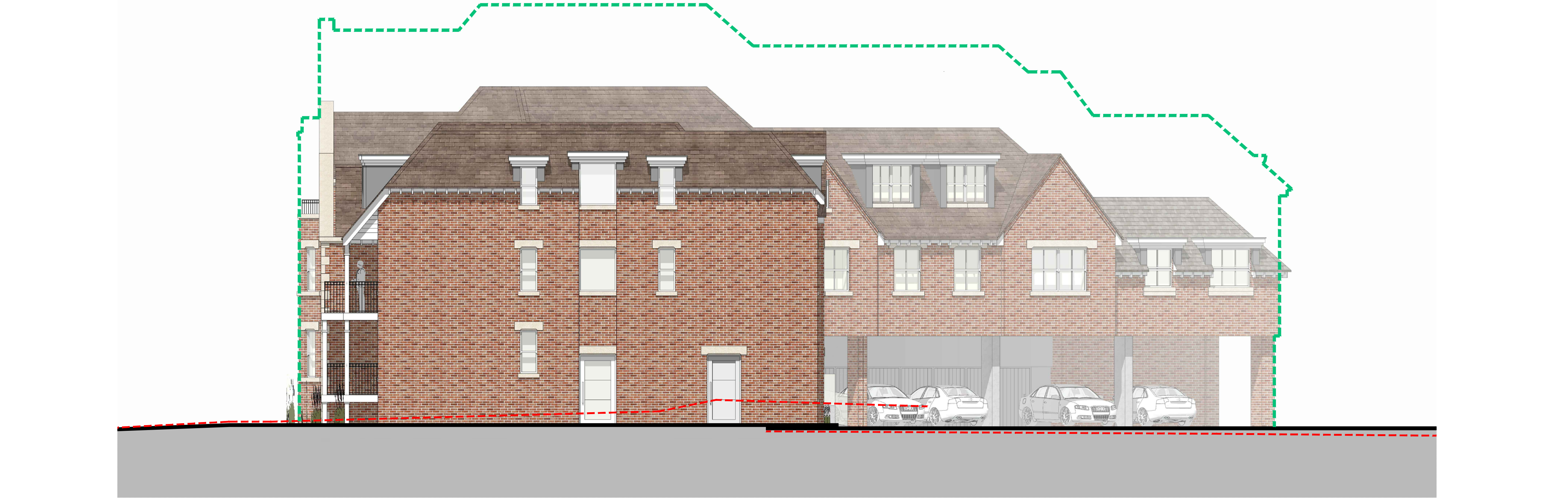
PROPOSED EAST ELEVATION 1 SCALE 1:100